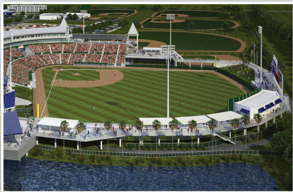
The new 360-degree boardwalk and concourse at Hammond Stadium will allow fans to watch the Minnesota Twins play from all angles of the field.

Throughout the past few years, the addition of the Boston Red Sox Spring Training facility, JetBlue Park, and the more recent renovations at the Minnesota Twins Spring Training Facility, Hammond Stadium, has provided exciting improvements for the overall fan experience. These changes create a sense of optimism and anticipation of drawing many more visitors to our area and consequently helping to fuel our local economy.