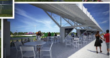
Lee County Sports Complex and Hammond Stadium renovations. Renderings courtesy of Populous.