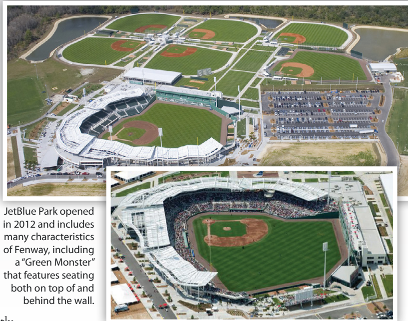
JetBlue Park opened in 2012 and includes many characteristics of Fenway, including a “Green Monster” that features seating both on top of and behind the wall.