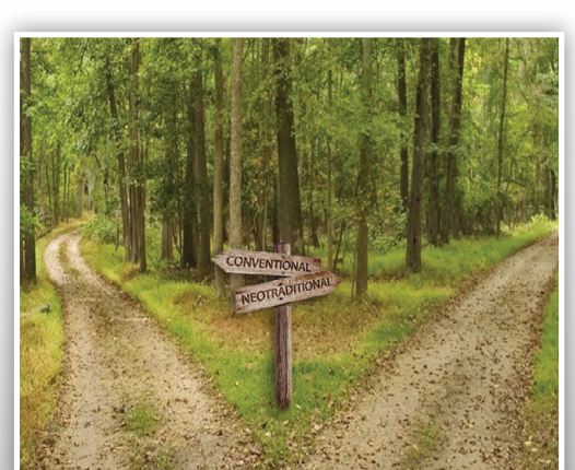
Choosing the Conventional versus Neotraditional approach presents transportation planners and designers a critical dilemma.

After World War II mass production of automobiles made them affordable and a newly viable transportation alternative for many families and businesses. At this time, we also saw the implementation of Eisenhower's Interstate System which gave increased access to an expansive country proving a boon for commerce and the national economy. With such convenient access in place, land planning policies then focused on low-density suburban residential communities. Getting out of crowded urban cities was desirable and living in "suburbia" with large grassed lawns was a good thing. To accommodate the needs of the "suburbanites" retail began to follow, leaving the traditional urban core and giving rise to shopping